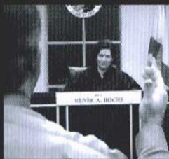
Circuit Judge Renée A. Roche

This brochure will give you a general overview of Business Court, the types of cases it handles and the benefits it provides. Additional information including case scheduling, form orders, procedural information and published rulings are available on the web, at www.ninja9.org/ Courts/Business/Index-BC.htm